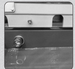
• Perspex Safety Guard