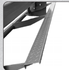
• Full Length Foot Pedal