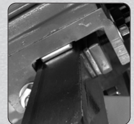
• Adjustable Wear Strips