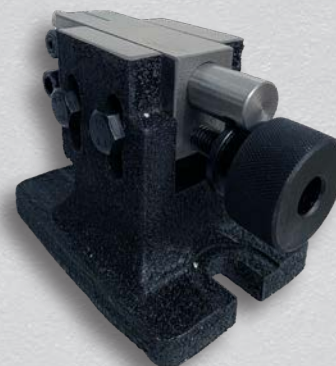
SEMI-UNIVERSAL DIVIDING HEAD & CHUCK